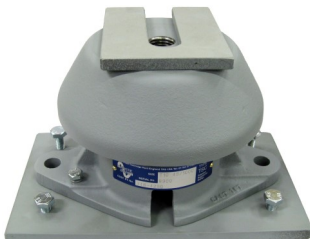
TSC T10 with optional proof plate above and optional soleplate below

Type approval by Det Norske Veritas and American Bureau of Shipping and general type approval has been given by Lloyd's Register of Shipping.