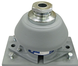
TSC T10 with optional height adjuster above and optional soleplate below